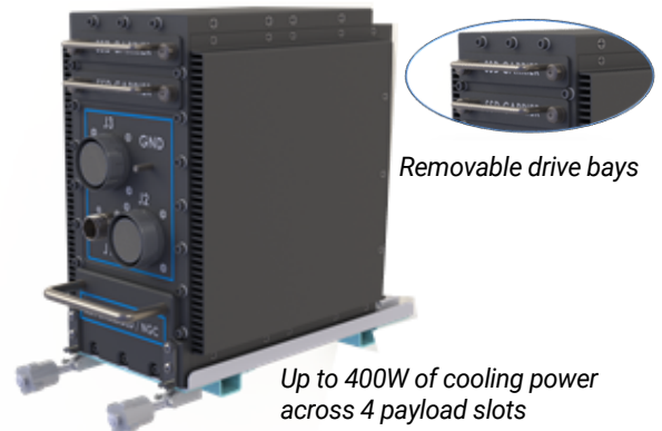
Removable drive bays